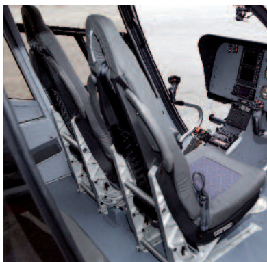
Energy absorbing seats

The EC120 B is equipped with dual controls, a twist-grip throttle, rotor brake and a VEMD indicating the torque, engine RPM and temperature limits.