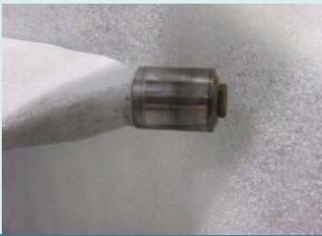
1. Loose bushing

An inspection is conducted to determine if the Starflex is repair worthy. If the part qualifies, the repair is launched.