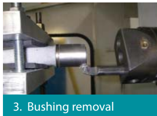
3. Bushing removal