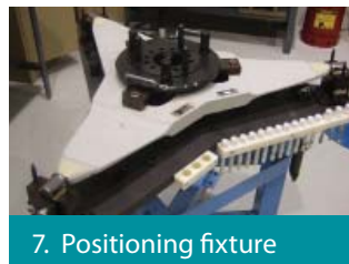
7. Positioning fixture