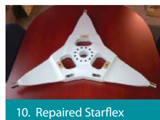
10. Repaired Starflex