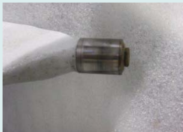
1. Loose bushing

An inspection is conducted to determine if the Starflex is repair worthy. If the part qualifies, the repair is launched.