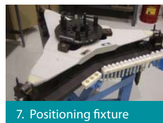
7. Positioning fixture