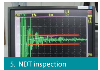
5. NDT inspection