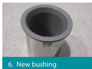
6. New bushing