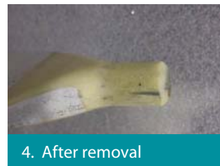
4. After removal