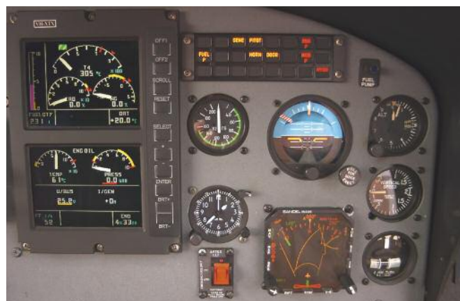
VEMD display on ground