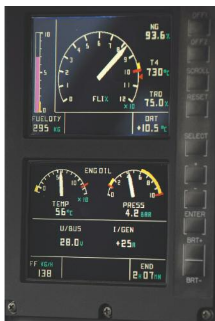
VEMD display in flight

The VEMD considerably reduces the flight crew's workload and improves safety, as the pilot can see all the parameters at a glance, including First Limit Indicator (FLI) and concentrate solely on his mission.