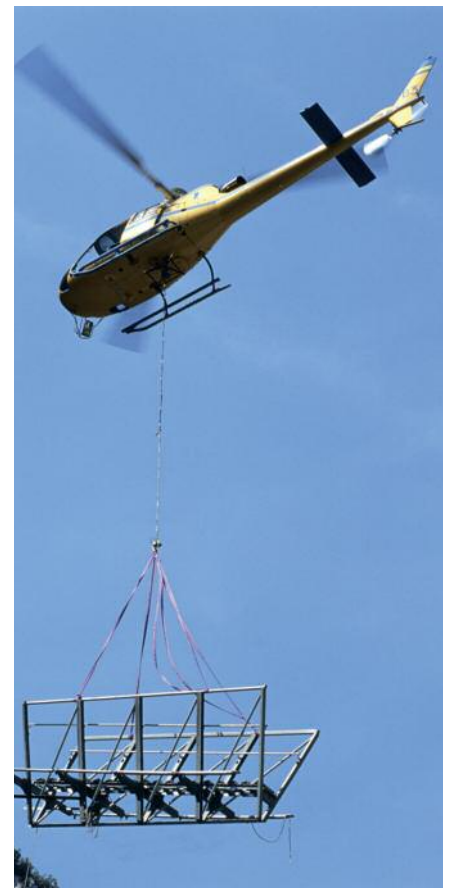
Air crane operations