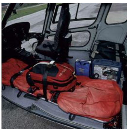
Emergency Medical Service kit

Infrared thermal imaging system (both modes can be recorded or transmitted via microwave downlink), moving map with zoom and GPS, tracker for following or locating stolen property or vehicles, wire-strike protection system, gyro-stabilised binoculars, simultaneous 4- channel police radio.