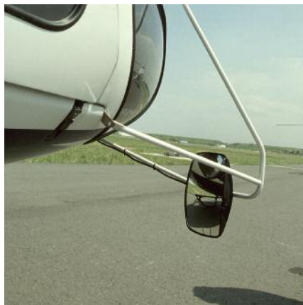
Electrical external mirror