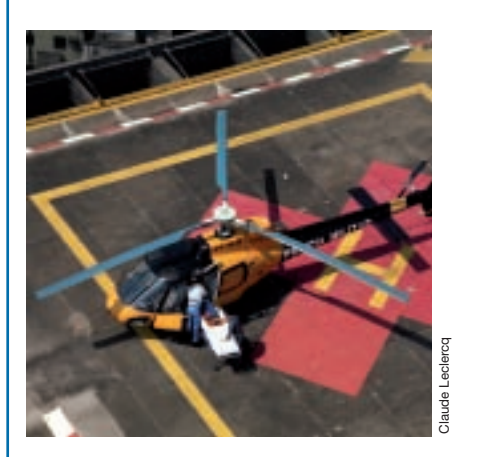
(*) At MTOW - (**) 2,370 kg with optional specific equipment kit.